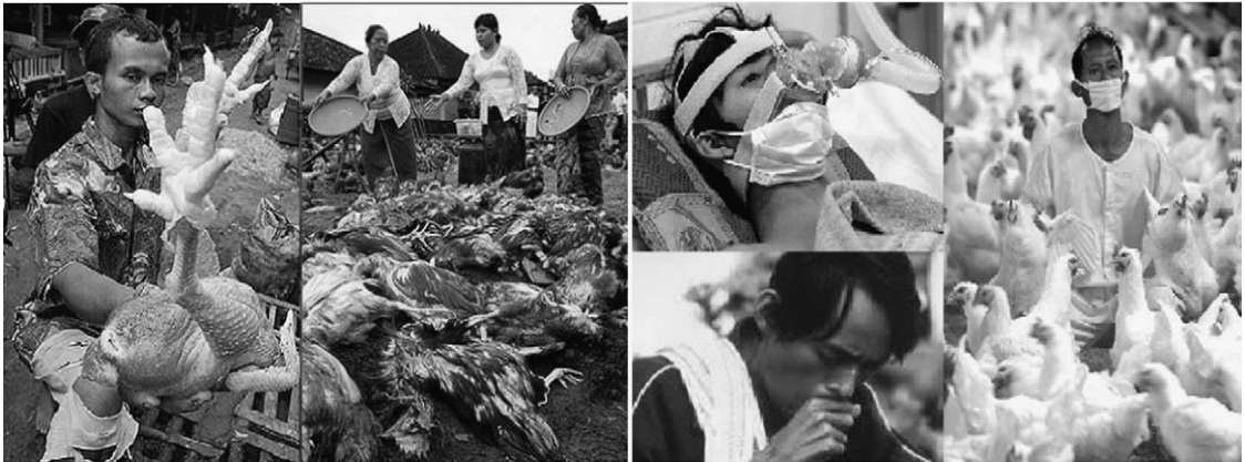
Fig. 1. Sample images incorporated in the fear appeal version.